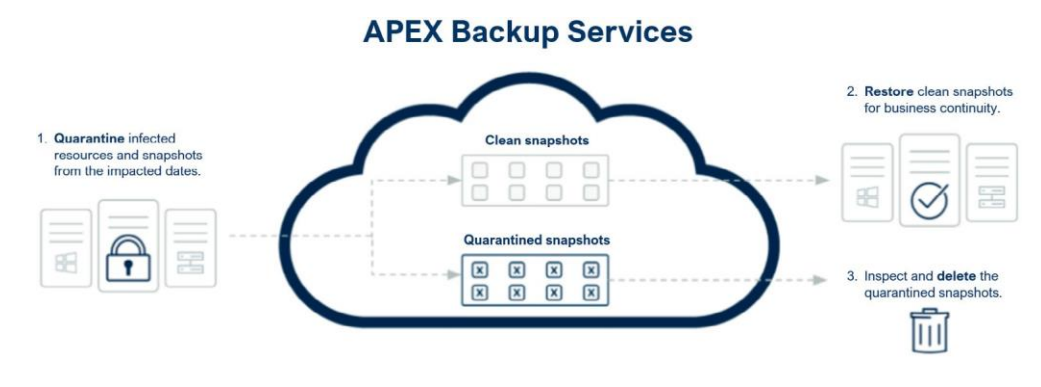
Robust architecture and automated tools accelerate recovery and reduce data loss.

Accelerated ransomware recovery also solves the problem of data loss due to point-in-time recovery. Now you can automatically identify the most recent clean version of every file within a specified timeframe and consolidate those versions into a single "Golden Snapshot". Eliminating the manual search and recovery process drastically reduces time to recover and prevents data loss.